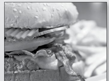
Albert's Burger Boo

We're so proud of the menu, we think you're gonna dig it too.