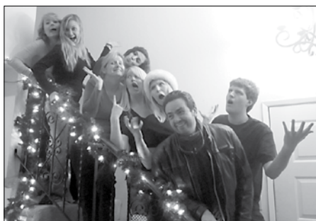
Our associates being silly at the gingerbread house party

admiring each other's fun gingerbread houses before they were delivered to the Northwest Reno Squeeze for display during the holidays. Did you get a chance to see them?