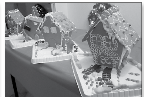
The final gingerbread houses