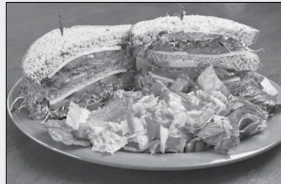
The "Beautiful Bonnie," newly named for our darling EggHead Bonnie Woods

Many of you will be happy to hear that we now offer turkey sausage! And for those of you making a New Year's resolution to eat better and be more healthy, we've added another item to our HOP (Healthy Obsession Program) Menu called " Shi's Super Food Scramble " which is egg whites, spinach, broccoli, red bell peppers and zucchini all scrambled up, served with toast (dry, of course), and a fruit cup or sliced tomatoes. We've permanently added the " Lake Taco " and " Wesley's Tri Tip Delight " omelettes, and tri tip is now an option on sandwiches and salads. Another salad option is lemon butter shrimp on the Caesar. Yum! We also added a new " Top Shelf Bloody Mary " in our Reno locations, made with Grey Goose vodka served with a crispy strip of bacon in it!