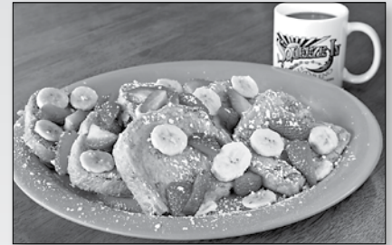
The Queen Victoria French Toast