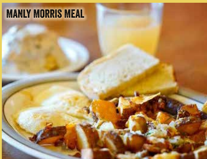
MANLY MORRIS MEAL

The "Manly" but without the biscuits and gravy* – 15.99