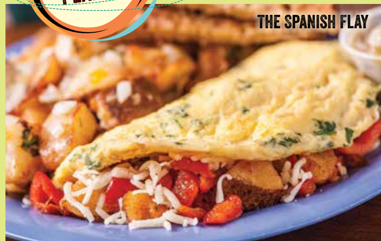
THE SPANISH FLAY