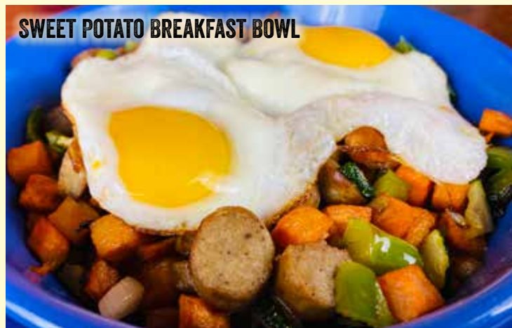
SWEET POTATO BREAKFAST BOWL

Sweet bowl, bro! Sweet potatoes, green onions, zucchini, green bell peppers, spinach and your choice of protein and topped with 2 eggs any style – 17.99