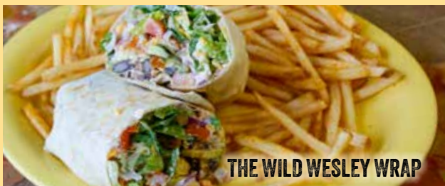
THE WILD WESLEY WRAP

THE WILD WESLEY SALAD WRAP The best of the southwest...Grilled chicken breast, black beans, shredded Jack & cheddar cheese, fresh-cut romaine lettuce, avocado, tomatoes, homemade pico de gallo and red onions wrapped in a jumbo flour tortilla. Served with a side of fries – 17.99