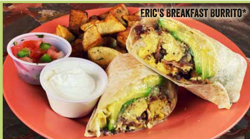
ERIC'S BREAKFAST BURRITO*