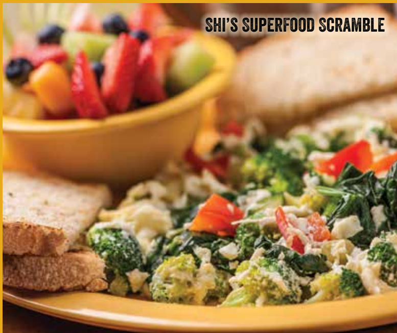
SHI'S SUPERFOOD SCRAMBLE

PRO TIP: ADD PESTO AND TURKEY SAUSAGE – 4.99