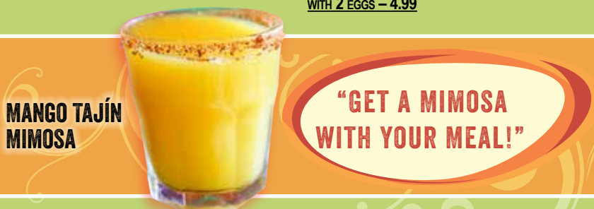
MANGO TAJÍN MIMOSA

LOAD 'EM UP! GET FULLY LOADED WITH 2 EGGS – 4.99