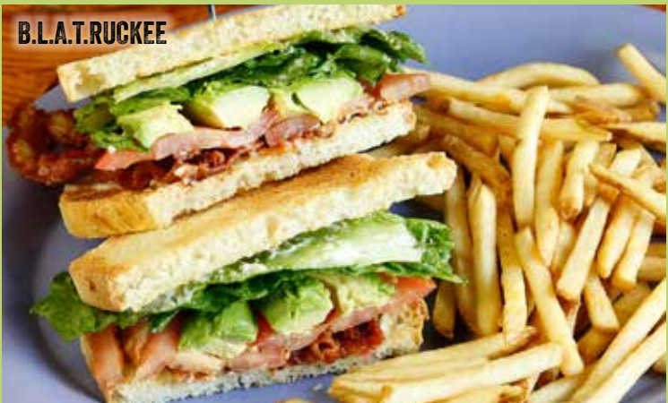
B.L.A.T. RUCKEE Born at Squeeze In in Truckee, CA in 1974...Crispy bacon, mayo, romaine lettuce, avocado and sliced tomato on perfectly toasted sourdough bread. Served with a side of fries – 17.99 Pro Tip: Looking for a club? Add turkey breast – 3.99

All sandwiches and burgers are served with your choice of fries or green salad!