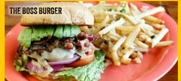
THE BOSS BURGER

The boss is in the building... A seasoned grilled hamburger on a brioche bun topped with Swiss cheese, premium bacon, sautéed mushrooms and avocado. Served with romaine lettuce, fresh-cut tomatoes and sliced red onions with a side of French fries – 19.99