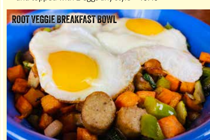
ROOT VEGGIE BREAKFAST BOWL

Rooting for you, one bite at a time! Root vegetable hash, green onions, zucchini, green bell peppers, spinach and your choice of protein and topped with 2 eggs any style – 19.49