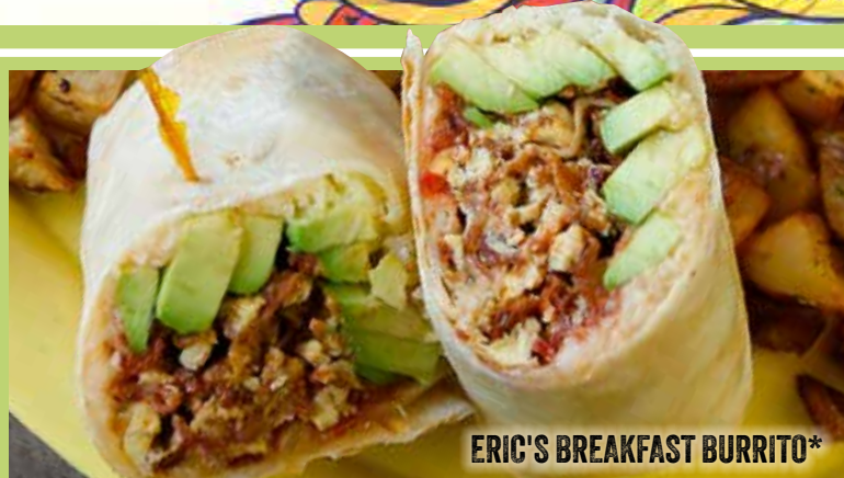
ERIC'S BREAKFAST BURRITO*

GET BUBBLY WITH YOUR BUDDIES, UPGRADE TO A MIMOSA PITCHER