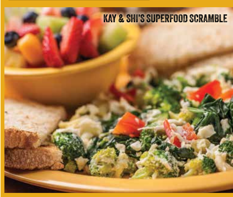
KAY & SHI'S SUPERFOOD SCRAMBLE

Pro Tip: Add pesto and turkey sausage – 4.99