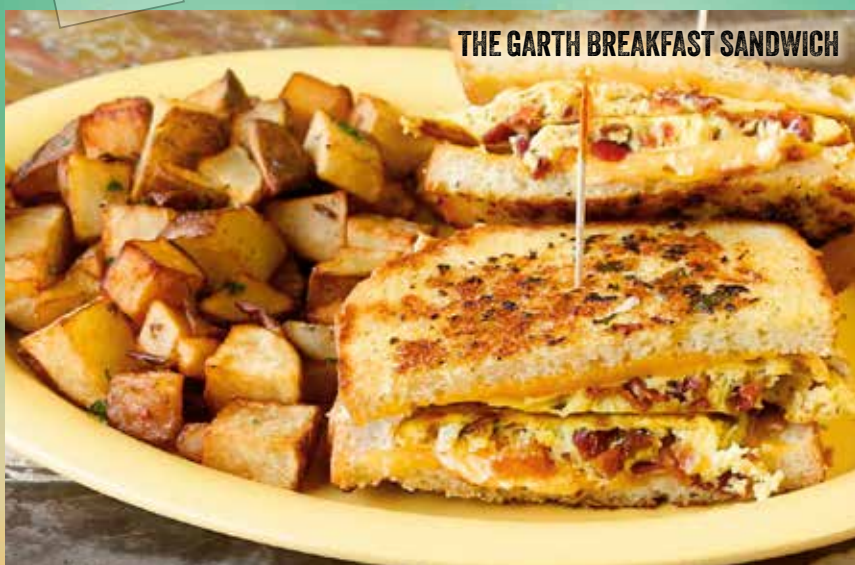
THE GARTH BREAKFAST SANDWICH