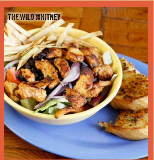
THE WILD WHITNEY